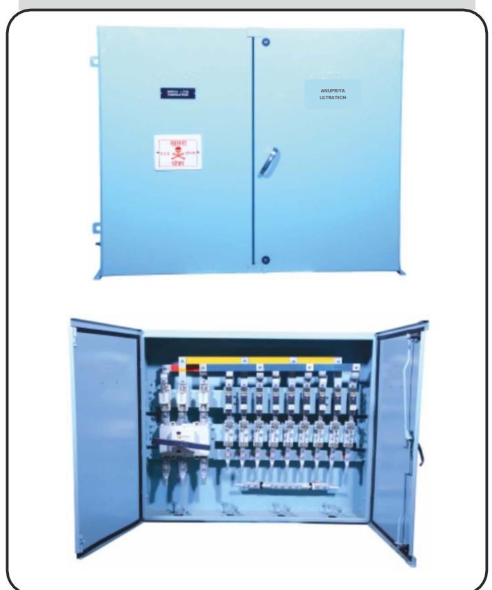
Fabrication - 200 Kva