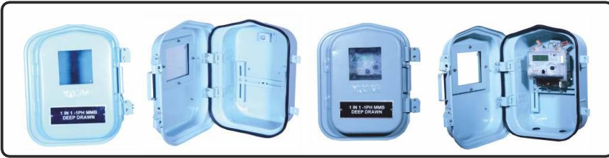
1 in 1 Single Phase