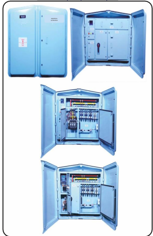
ODB (Deep Drawn)

For mechanical inspection as well as testing of electrical assemblies