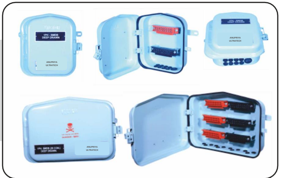
1Phase AB Cable DB, SMDB, Pole Top DB