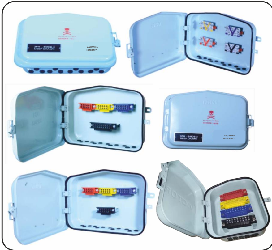
3 Phase AB Cable DB, SMDB, Pole Top DB