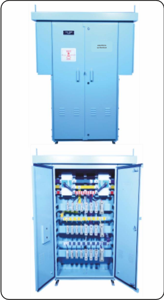
Feeder Pillars (Fabrication) 8 Way