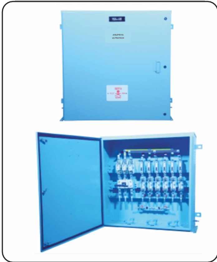
Fabrication - 63 / 100 Kva