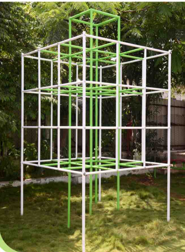
KMPE-009 SQUARE JUNGLE GYM

Age Group : 6 - 14 Yrs. Safe Play Area : O 3.5 M Area : O 2.0 M Product Height : 3.0 M