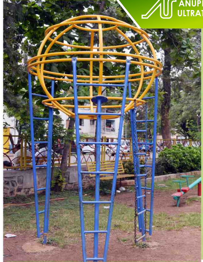
KMPE-008 SATELITE CLIMBER

Age Group : 4 - 12 Yrs. Safe Play Area : 1.6 M 2.1 M Area : 0.6 m x 1.1 M. Product Height : 2.0 M