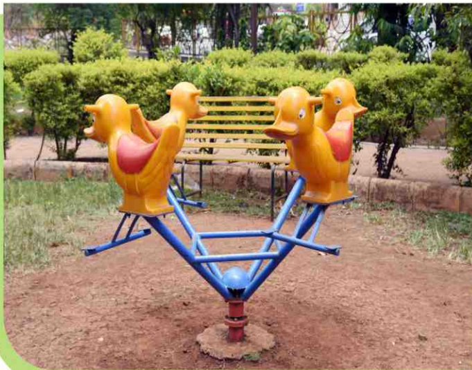
KMPE-019 FOUR SEATER M.G.R. (ANIMAL)

Age Group : 3 - 10 Yrs. Safe Play Area : 0 2.5 M Area : 0 1.5 M. Product Height : 0.8 M.