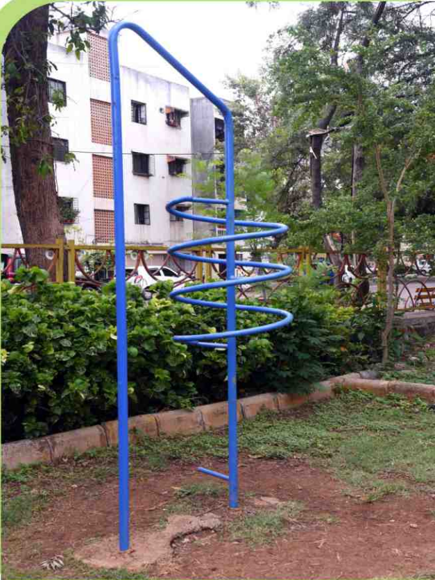
KMPE-007 SPIRAL CLIMBER

Age Group : 4 - 12 Yrs. Safe Play Area : 1.6 M 2.1 M Area : 0.6 m x 1.1 M. Product Height : 2.0 M