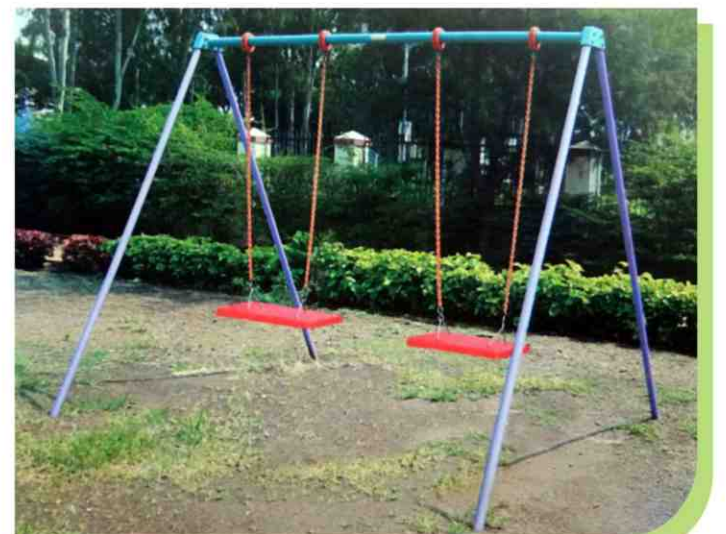
KMPE-022 TWO SEATED SWEING

Age Group : 5 -12 Yrs. Safe Play Area : 1.25 M. X 2.6 M. Area : 4.5 M. X 2.6 Product Height : 0.5 M.