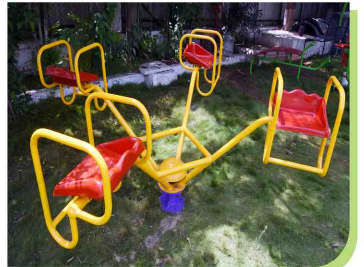
KMPE-020 FOUR SEATER M. G. R.

Age Group : 3 - 10 Yrs. Safe Play Area : 0 2.5 M Area : 0 1.5 M. Product Height : 0.8 M.