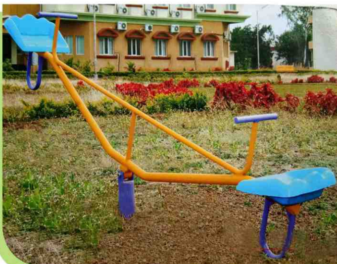
KMPE-021 STANDERD SEA-SAW (TWO SEATER)

Age Group : 3 -12 Yrs. Safe Play Area : 0 2.7 M. Area : 0 1.9 M. Product Height : 0.9 M.