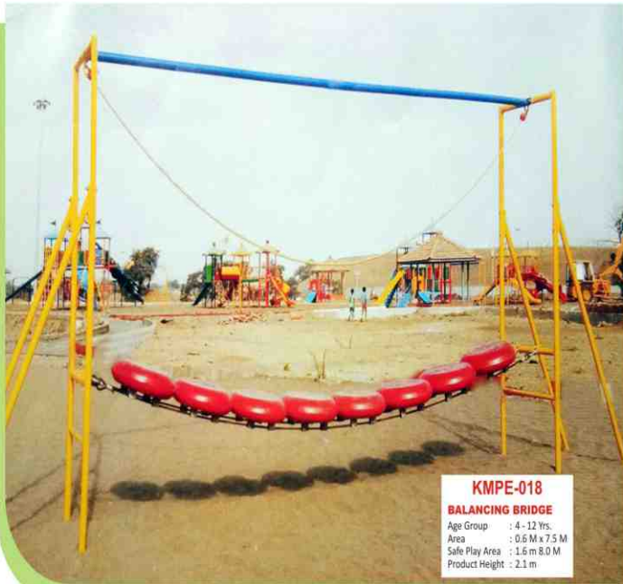
KMPE-018 BALANCING BRIDGE Age Group : 4 -12 Yrs. Area : 0.6 M x 7.5 M Safe Play Area : 1.6 m 8.0 M Product Height : 2.1 m