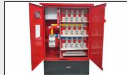
NEXSTEP ELECTRICAL Leading Manufacturer of LT Distribution Equipments.