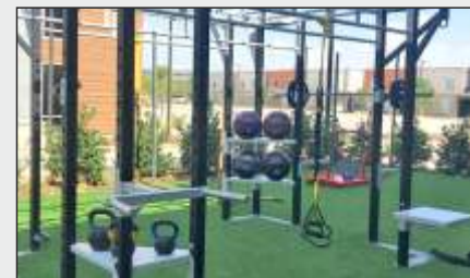
NEXFIT Leading Manufacturer of Garden Play Equipment, Outdoor & Indoor fitness equipments.