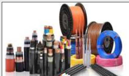
NEXSTEP CABLE PVT. LTD Leading Manufacturer of Cable and Wires.