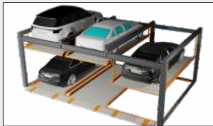
NEXSTEP MULTIPARKING PVT LTD. Leading Manufacturer of Automated Multilevel Parking Systems.